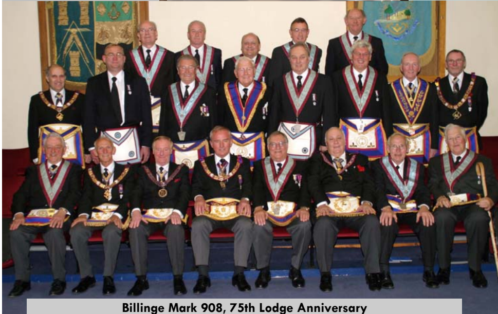
Billinge Mark 908, 75th Lodge Anniversary