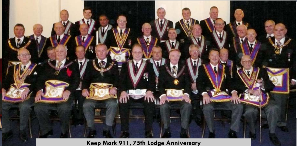
Keep Mark 911, 75th Lodge Anniversary