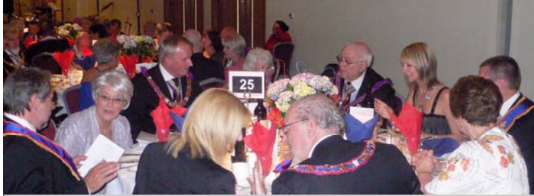
139th Mark Benevolent Fund Festival, Staffordshire & Shropshire