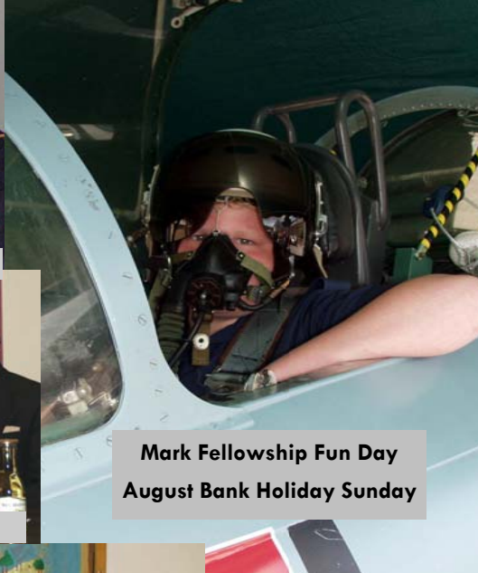
Mark Fellowship Fun Day August Bank Holiday Sunday