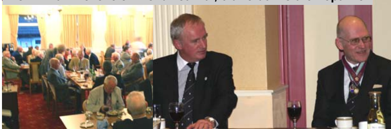
Golf Dinner at Worsley